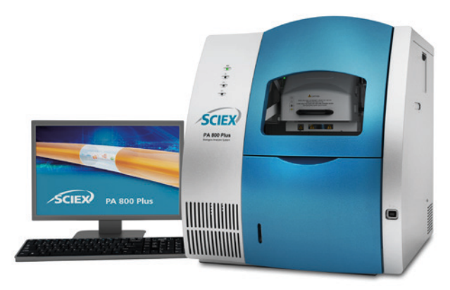
The PA800 Plus Pharmaceutical Analysis System.